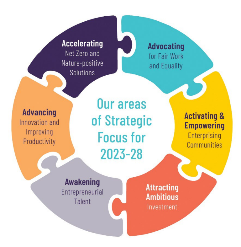
Figure 1 - Priorities from Our Five-Year Plan

2023/24 was a year of further successful delivery for SOSE, striving ahead to deliver the vision for a Green, Fair and Flourishing, South of Scotland.