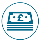
Exhibit 3. Recent major developments affecting the college sector These bring challenges and opportunities.

23. Several national reviews have recently recommended major changes that would affect the college sector, and these sit alongside other significant developments ( Exhibit 3 ). They all bring both challenges and opportunities for the Scottish Government. There are questions about what can realistically be achieved in the short term and what may require a longer timescale, possibly involving new legislation.